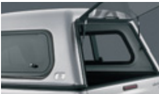
CANOPY RANGE (HIGH ROOF SHOWN) Double Cab only