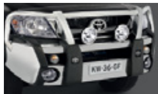
4X4 FORGE ALLOY BULL BAR - WITH OPTIONAL DRIVING LIGHTS (SOLD SEPARATELY)