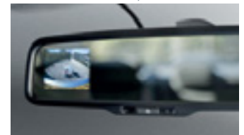
ELECTROCHROMATIC MIRROR & REAR VIEW CAMERA* (SOLD SEPARATELY) All Utility models