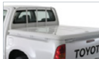
HARD TONNEAU COVER RANGE (1 DECK SHOWN) Double Cab Utility only