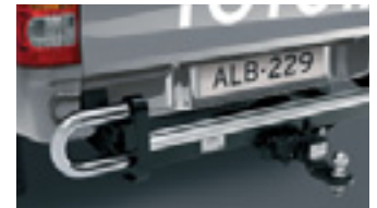
TOWBAR RANGE (TOWBAR WITH REAR STEP (2250kg Braked)* SHOWN WITH OPTIONAL TOWBALL & TRAILER WIRING HARNESS)