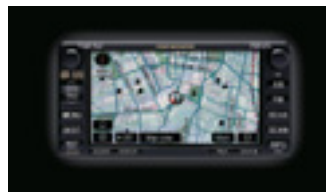
SATELLITE NAVIGATION AUDIO SYSTEM* - INCLUDES 4 IN-DASH MP3 CD CHANGER & RADIO WITH BLUETOOTH™** HANDSFREE COMMUNICATIONS