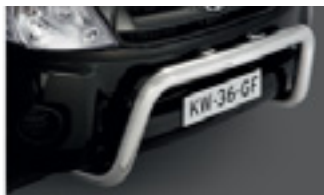
ALLOY NUDGE BAR - AIRBAG COMPATIBLE

THESE ARE JUST SOME OF THE ACCESSORIES AVAILABLE. FOR A COMPLETE LIST AND FURTHER DETAILS, PLEASE SEE YOUR TOYOTA DEALER OR VISIT ACCESSORIES.TOYOTA.COM.AU