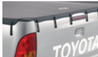
SOFT TONNEAU COVER RANGE (A DECK SHOWN) All Utility models