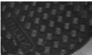
ALL WEATHER RUBBER FLOOR MATS FRONT & REAR AVAILABLE (SOLD SEPARATELY)