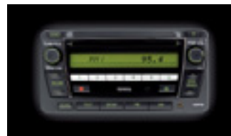
6 IN-DASH MP3 COMPATIBLE CD CHANGER & RADIO WITH BLUETOOTH™** HANDSFREE COMMUNICATIONS & AUXILIARY AUDIO INPUT Workmate & SR models only