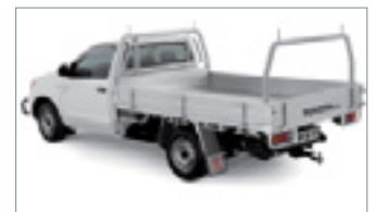
TRAY BODY RANGE (ALLOY TRAY BODY WITH OPTIONAL REAR RACK & ALLOY WINDOW PROTECTOR SHOWN)