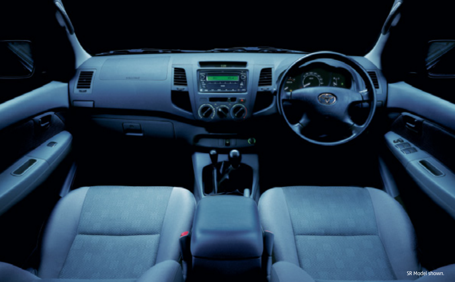
SR Model shown.