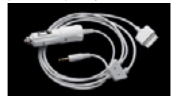
AUDIO CABLE & CAR CHARGER FOR IPOD®**