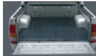
ALL WEATHER RUBBER UTE MAT All Utility models