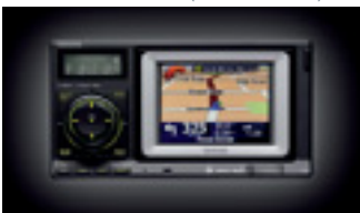
FOLLOWME SOUND & NAVIGATION SYSTEM* - INCLUDES SINGLE IN-DASH MP3 CD CHANGER & RADIO WITH BLUETOOTH™** HANDSFREE COMMUNICATIONS, USB IN & (OPTIONAL) IPOD® CONTROL‡