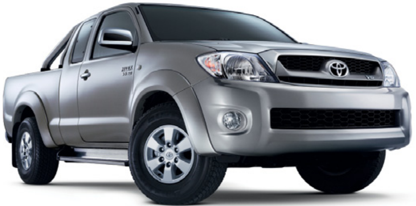
4x4 Xtra Cab SR5 model shown.