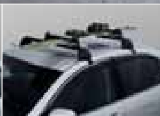
4 & 6 SKI CARRIER (SOLD SEPARATELY)