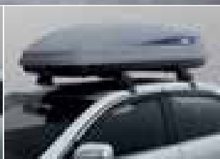
PACIFIC 200 ROOF POD