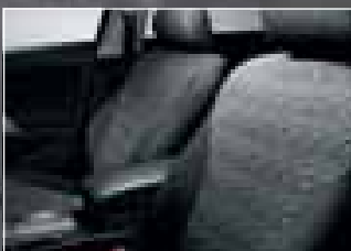
SEAT COVERS - FRONT & REAR (SOLD SEPARATELY)

Grey applicable for Altise & Ateva. Sandstone applicable for Ateva only. Front Seat Covers are Airbag Compatible.