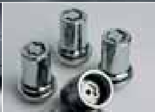
ALLOY WHEEL LOCK NUT SET