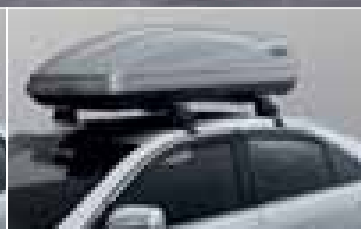
ATLANTIS 200 ROOF POD