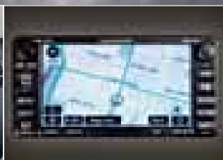
SATELLITE NAVIGATION AUDIO SYSTEM* INCLUDES 4-IN-DASH MP3 CD CHANGER & RADIO WITH BLUETOOTH™ HANDSFREE COMMUNICATIONS°

Applicable for Altise, Ateva & Sportivo.