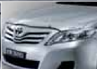
BONNET PROTECTOR & HEADLAMP COVERS (SOLD SEPARATELY)