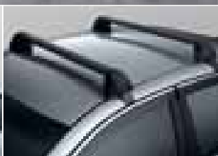
AERO ROOF RACKS (2 BAR SET).