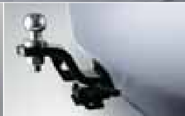
1200KG TOWBAR (BRAKED CAPACITY), TOWBALL & TRAILER WIRING HARNESS (SOLD SEPARATELY)**