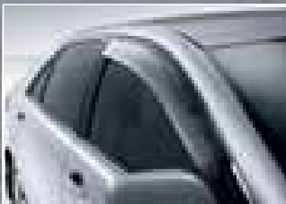
FRONT WEATHERSHIELDS (SOLD SEPARATELY)

Reverse ParkAssist not applicable on Grande.