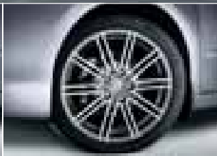
KAPPA ALLOY WHEEL (18" X 7.5")