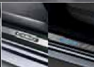
SCUFF PLATES - CHROME (FRONT & REAR SETS) & ILLUMINATED (FRONT ONLY) (SOLD SEPARATELY)

SAFETY WARNING: Fitment of Front Seat Covers which are not compatible with Front Seat Side airbags may adversely affect airbag deployment and may result in serious injury.