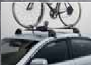
PRO RIDE BICYCLE CARRIER