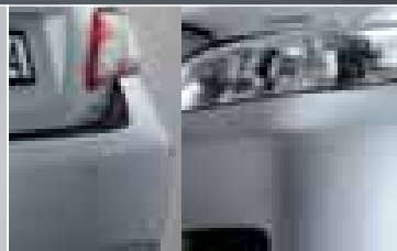
PARKASSIST + - CLEARANCE PARKING SENSORS (2-HEAD KIT) & REVERSE PARKING SENSORS (4-HEAD KIT) (SOLD SEPARATELY)

Reverse ParkAssist not applicable on Grande.