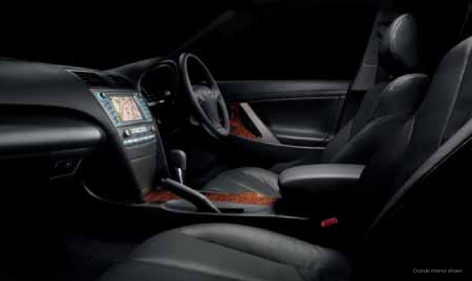
Grande interior shown.