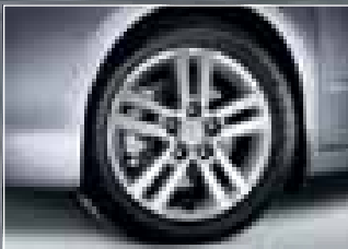
RAPTOR ALLOY WHEEL (16" X 7")